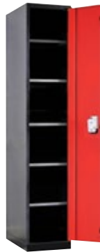
Full Door Cabinet