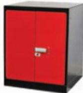
DOUBLE DOOR PEDESTAL

Perfect as stand-alone units or as supports for workbenches. These versatile all-welded heavy-duty modules are available in multiple sizes and configurations and provide ample storage for tools.