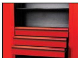
CHOOSE FROM 2 OR 3 DRAWER INSERTS

Each modular drawer unit is 15" high and is available in a 2-drawer or 3-drawer version. Drawers allow maximum weight bearing capacity by combining heavy 14 gauge construction with super-strength 500 lb. capacity full-extension glides. The full extension allows full use of each drawer.