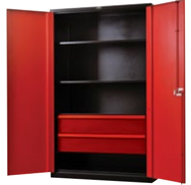
Extra Heavy-Duty Storage Cabinet (shown with optional drawers)

The Modular Utility Storage & Workbench System provides everything you need to create your own perfect workspace solution.