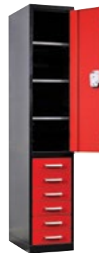
6 Drawer Cabinet