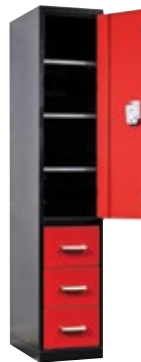
3 Drawer Cabinet