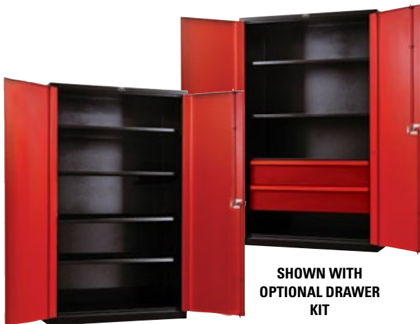
SHOWN WITH OPTIONAL DRAWER KIT

Fabricated of extra heavy-duty 14 gauge steel, reinforced doors and 1,450 lb. capacity adjustable shelves, durability is an understatement. Best-in-class super-duty 13 gauge full height hinge and 3/16" ergonomically engineered cremone turn-handle insure proper door alignment and operation for a lifetime of use. Each cabinet includes 4 full-width shelves.