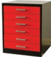
6 DRAWER PEDESTAL