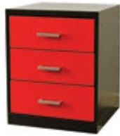
3 DRAWER PEDESTAL