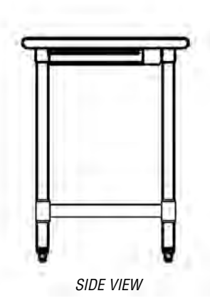
(FLAT TOP TABLE SHOWN WITH CRANK HANDLE AT LEFT END)

To indicate location of crank case, add suffix "-L" (left end), "-R" (right end), or "-C" (center) at end of model number. Example: T2448-SE-HA-L