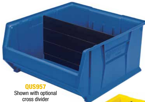
QUS957 Shown with optional cross divider