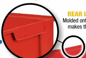
REAR LARGE HANDLE Molded onto back of containers makes them easy to carry!