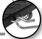
ATTACHED PULL RING allows dolly to be pulled with ease