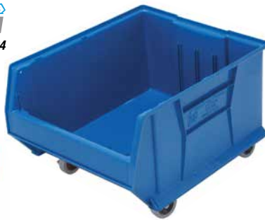
MOBILE HULK CONTAINER Ideal for transport of heavy and bulky parts. Bin comes with 4 swivel, 3" polyurethane casters, all with brakes, allowing up to 250 lb. mobile load capacity