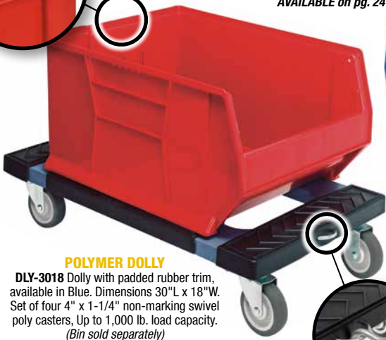
POLYMER DOLLY DLY-3018 Dolly with padded rubber trim, available in Blue. Dimensions 30"L x 18"W. Set of four 4" x 1-1/4" non-marking swivel poly casters, Up to 1,000 lb. load capacity. (Bin sold separately)