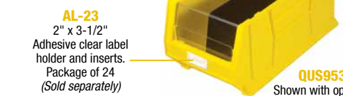
AL-23 2" x 3-1/2" Adhesive clear label holder and inserts. Package of 24 (Sold separately)