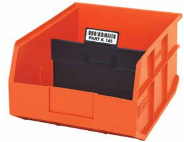
STACKABLE SHELF BIN Shown with optional Divider and DLT-6 Divider Label Tabs attach to existing dividers to improve the visibility of bin labels and scanning of barcodes. Package of 6. (Dividers and Label Tabs sold separately)

Available in: ● Blue ● Gray ● Ivory ● Black ● Orange