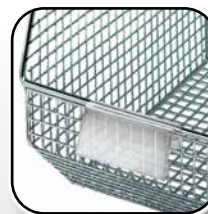
Shown with optional HBL3C Clear Label Holder Fits 1-1/8" x 3" Label (Sold separately)

INSTANT VISIBILITY NO DUST OR DIRT BUILDUP ALL WELDED