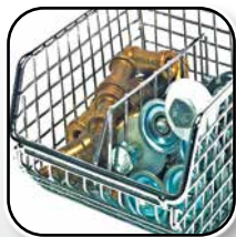
Shown with optional Divider (Sold separately)