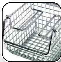
Shown with optional Side Stacking Ledge Pair (Sold separately)