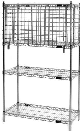
security module with flip-up door

(security modules shown assembled to wire shelf units)