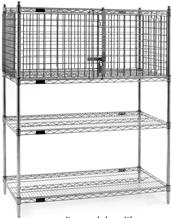
security module with hinged doors

* See charts on back for full model numbers.