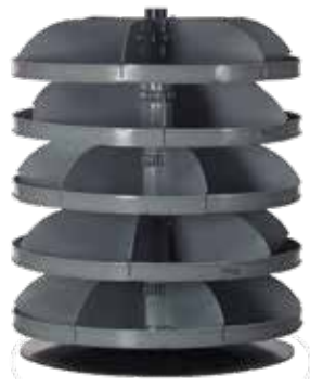
28" Diameter 500 lbs. capacity per shelf (weight evenly distributed)