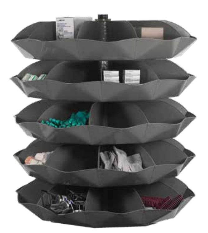
58" Diameter 2000 lbs. capacity per shelf (weight evenly distributed)