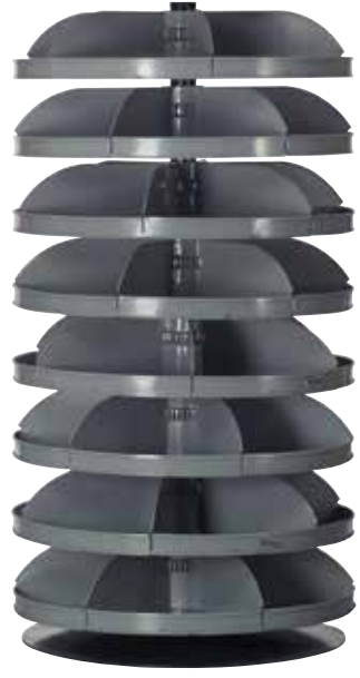
34" Diameter 500 lbs. capacity per shelf (weight evenly distributed)