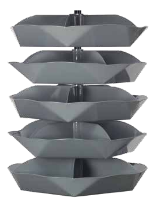
44" Diameter 625 lbs. capacity per shelf (weight evenly distributed)