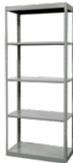
5-SHELF UNIT 3-ADJUSTABLE SHELVES

Fully Adjustable Intermediate Shelves with fixed top and bottom for a strong unit that DOES NOT require CROSS Braces