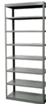
8-SHELF UNIT 6-ADJUSTABLE SHELVES