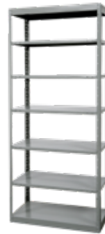
7-SHELF UNIT 5-ADJUSTABLE SHELVES