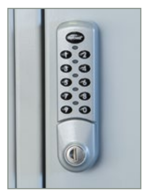
Built-in Electronic Access Digitech lock - also acts as locker handle