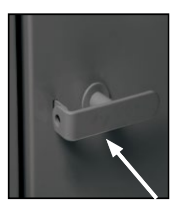
Heavy-Duty 3/16" thick steel handle with padlock hasp.