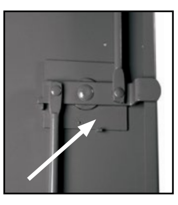
1/8" thick latch and 3/8" diameter lock rods insure maximum security