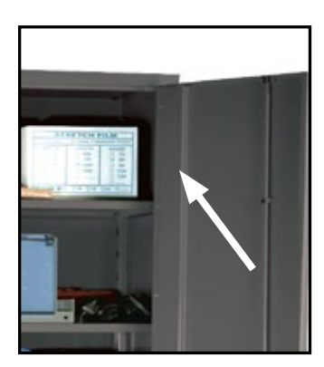
18-gauge full-height door stiffener provides maximum rigidity to both doors