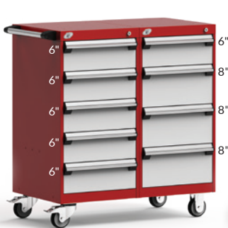
9 DRAWERS L3BED-3433__ 36" x 21" x 39 1/8" L3BEG-3433__ 36" x 27" x 39 1/8"