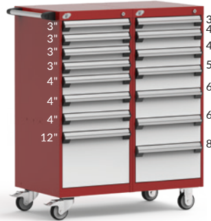
15 DRAWERS L3BED-4003__ 36" x 21" x 45 1/8" L3BEG-4003__ 36" x 27" x 45 1/8"