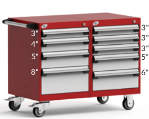
9 DRAWERS L3BED-2401__ 36" x 21" x 29 1/8" L3BEG-2401__ 36" x 27" x 29 1/8"