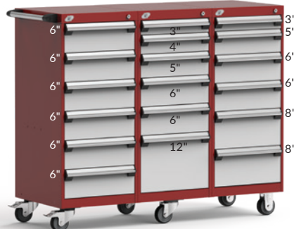
18 DRAWERS L3BJD-4001__ 54" x 21" x 45 1/8" L3BJG-4001__ 54" x 27" x 45 1/8"