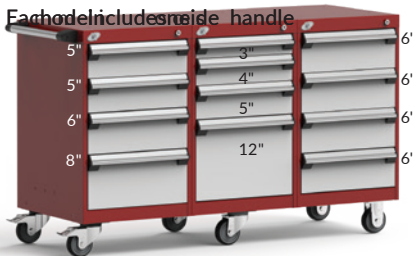
12 DRAWERS L3BJD-2801__ 54" x 21" x 33 1/8" L3BJG-2801__ 54" x 27" x 33 1/8"