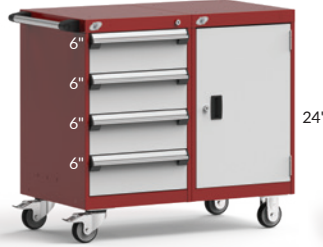
4 DRAWERS / 1 DOOR / 1 SHELF L3BED-2823__ 36" x 21" x 33 1/8" L3BEG-2823__ 36" x 27" x 33 1/8"