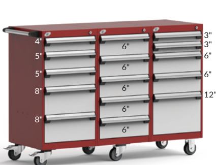
15 DRAWERS L3BJD-3401__ 54" x 21" x 39 1/8" L3BJG-3401__ 54" x 27" x 39 1/8"