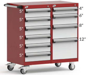
10 DRAWERS L3BED-3431__ 36" x 21" x 39 1/8" L3BEG-3431__ 36" x 27" x 39 1/8"