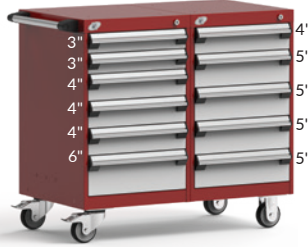
11 DRAWERS L3BED-2801__ 36" x 21" x 33 1/8" L3BEG-2801__ 36" x 27" x 33 1/8"