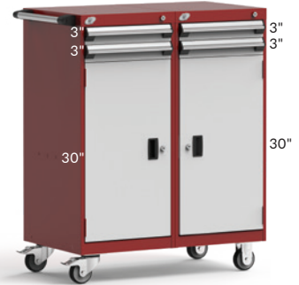
4 DRAWERS / 2 DOORS / 2 SHELVES L3BED-4033__ 36" x 21" x 45 1/8" L3BEG-4033__ 36" x 27" x 45 1/8"