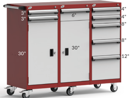
8 DRAWERS / 2 DOORS / 2 SHELVES L3BJD-4003__ 54" x 21" x 45 1/8" L3BJG-4003__ 54" x 27" x 45 1/8"