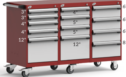
13 DRAWERS L3BJD-3001__ 54" x 21" x 35 1/8" L3BJG-3001__ 54" x 27" x 35 1/8"