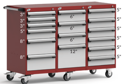
16 DRAWERS L3BJD-3403__ 54" x 21" x 39 1/8" L3BJG-3403__ 54" x 27" x 39 1/8"