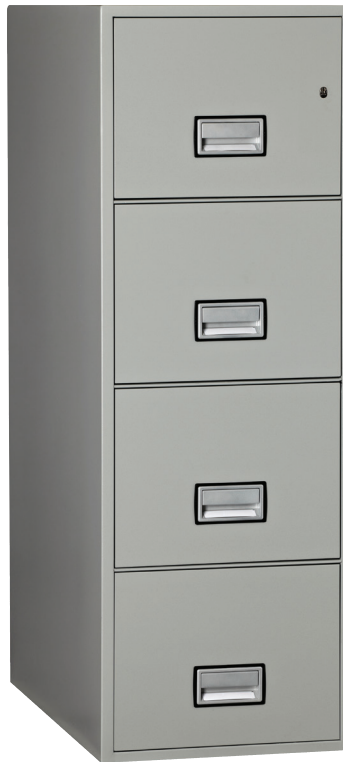
LGL4W25 Light Gray